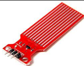
Figure 2: Water level sensor

Optional: Gas or air quality sensors can be added based on application need