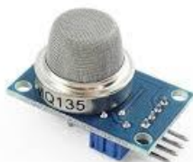
Figure 3: Gas/Air quality sensor

Optional: Gas or air quality sensors can be added based on application need